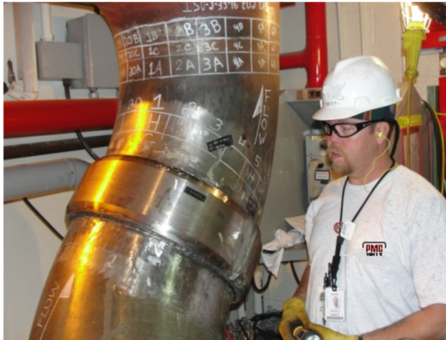
360 Degree 2-Piece Split PMCap